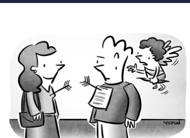
"If you could fill out the attached survey that would really help me out."